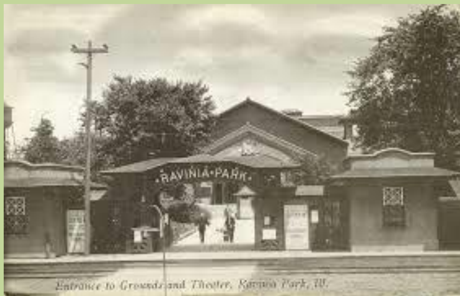
Entrance to Grounds and Theater, Ravinia Park, Ill.