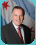
Mayor Richard M. Daley Chicago, Illinois Founding U.S. Chair and Director