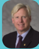
Mayor David Miller Toronto, Ontario Founding Canadian Chair and Director