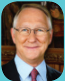
Mayor Gérald Tremblay Montréal, Québec Director, St. Lawrence/Québec