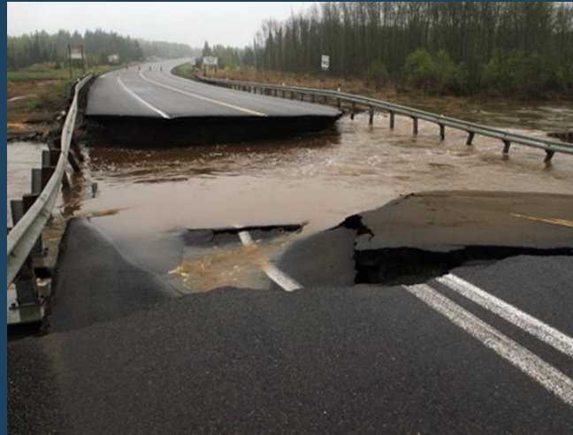
Thunder Bay, ON May 2012 Flood