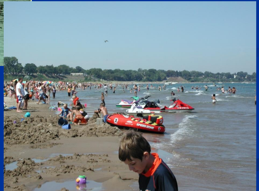
North Beach - 2009