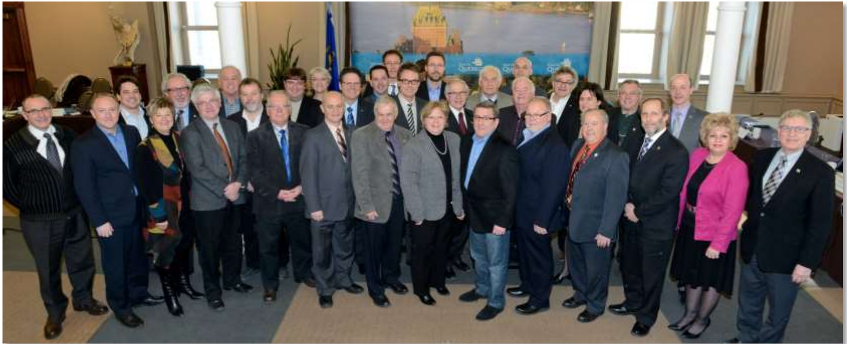
Group picture of mayors, January 25 th , 2013

September 26 th , 2012 / January 25 th and May 3 rd , 2013