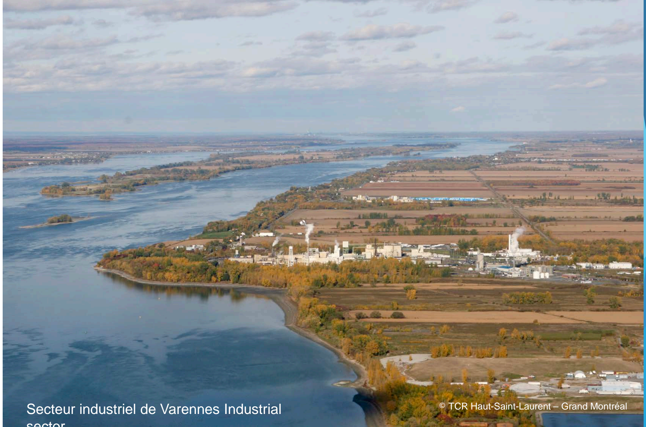
Secteur industriel de Varennes Industrial sector