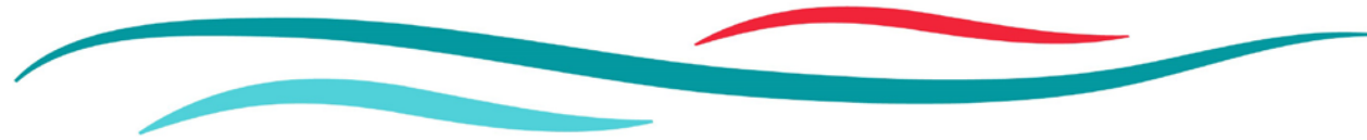
TABLE DE CONCERTATION RÉGIONALE