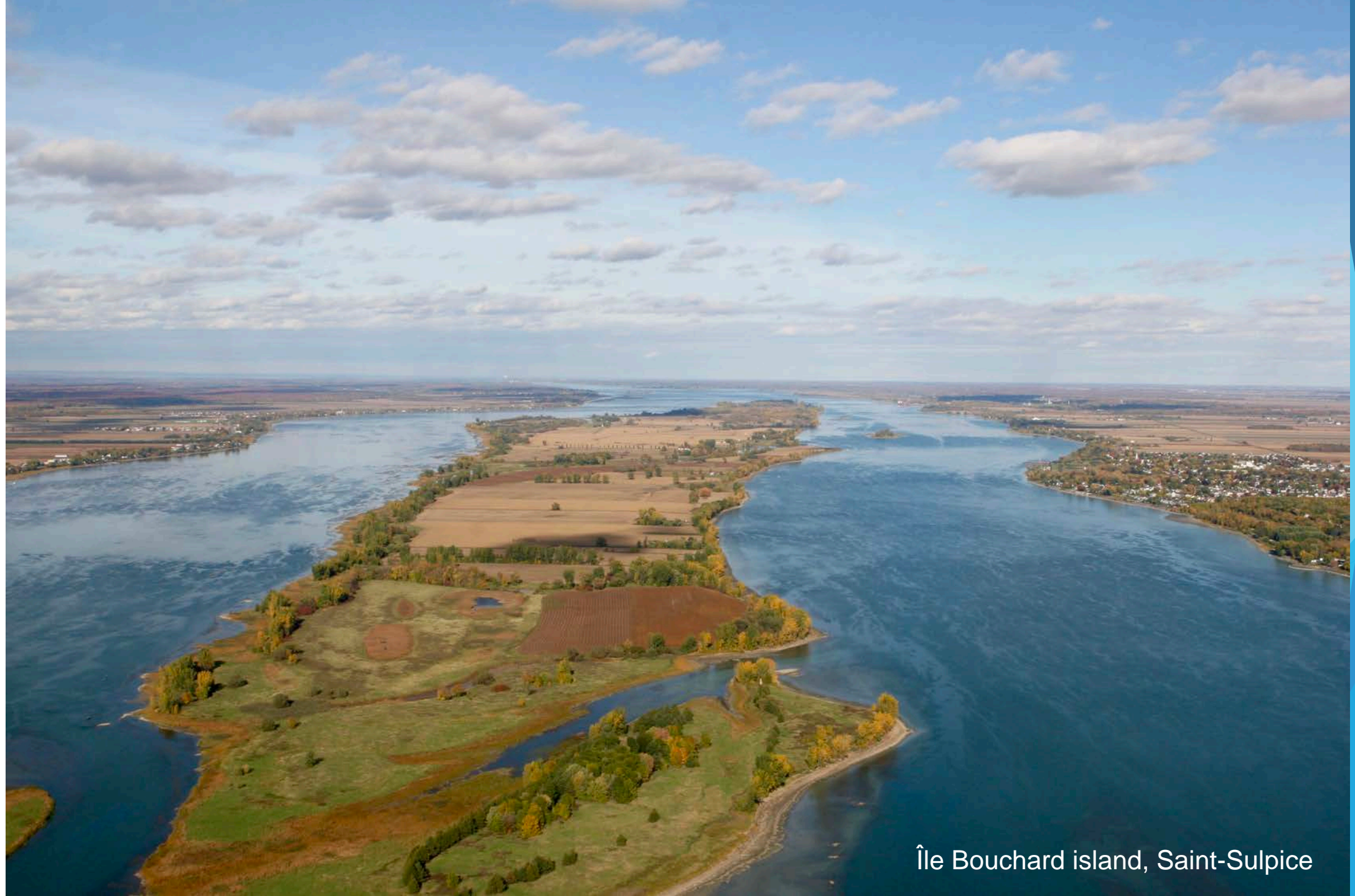
Île Bouchard island, Saint-Sulpice