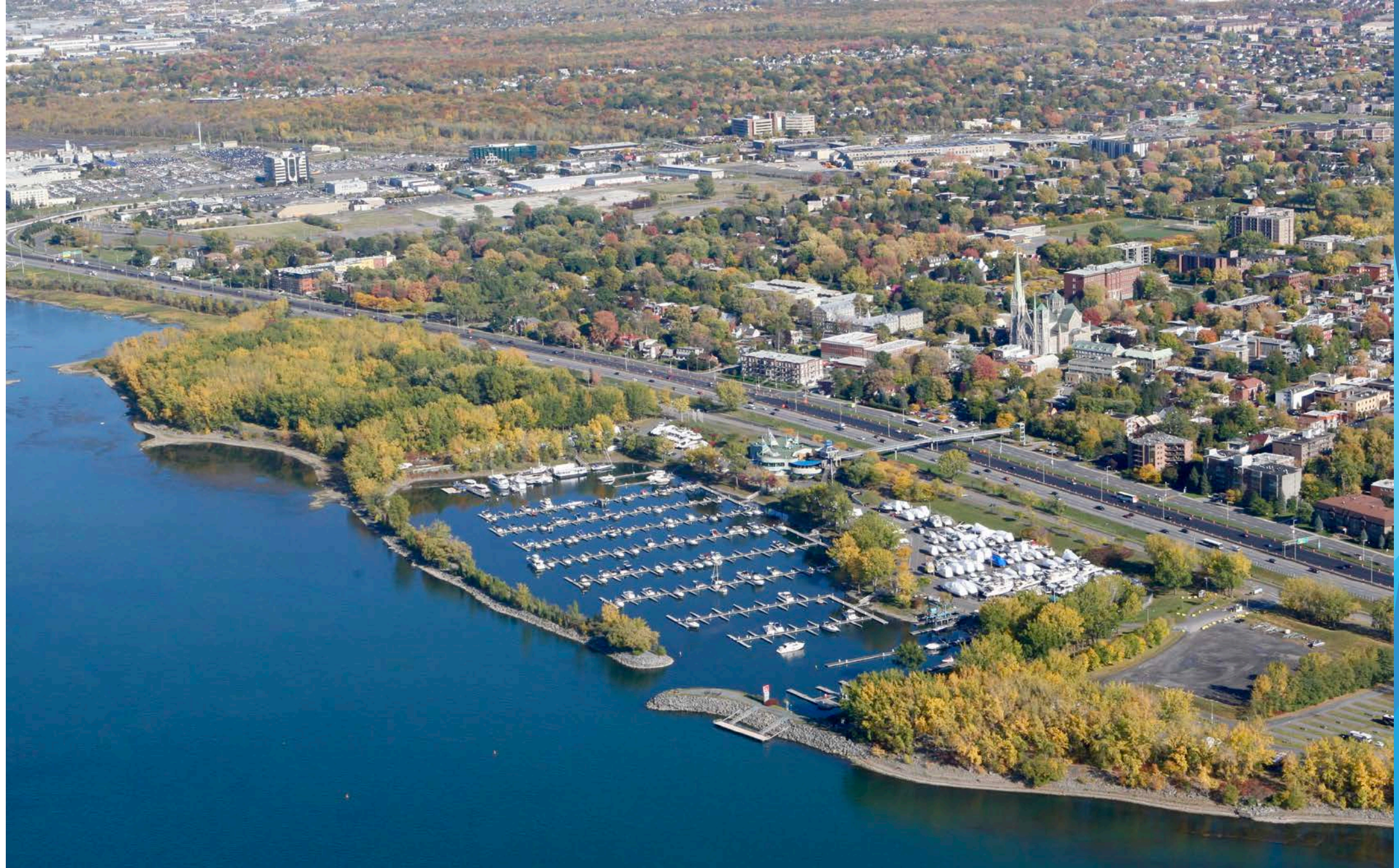
Port de plaisance Bouvier, Longueuil