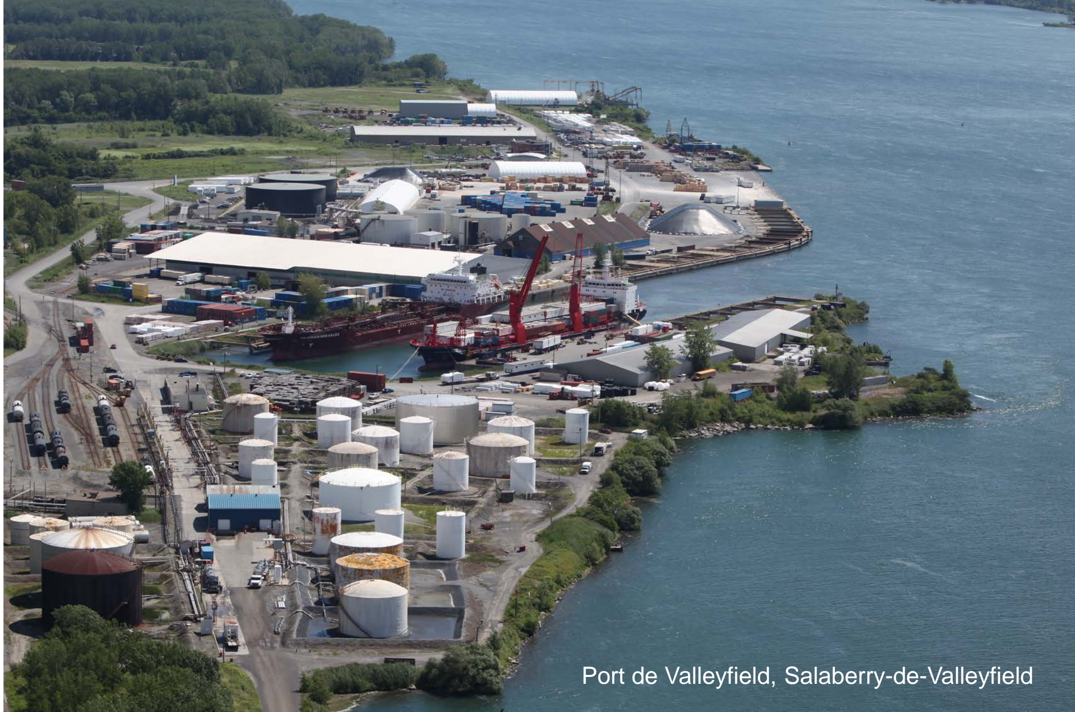
Port de Valleyfield, Salaberry-de-Valleyfield