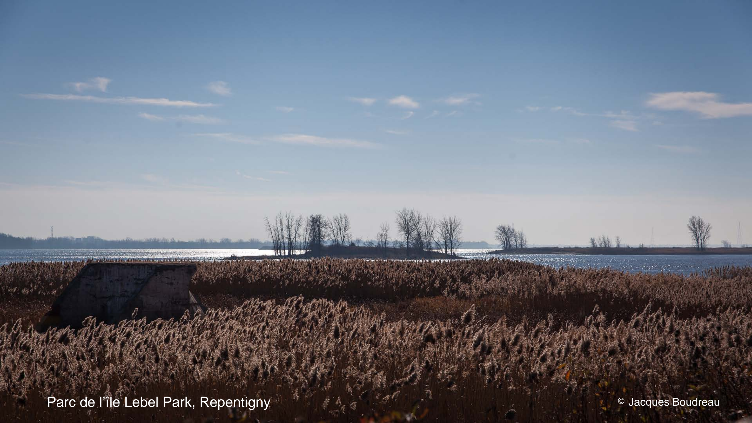
Parc de l'île Lebel Park, Repentigny