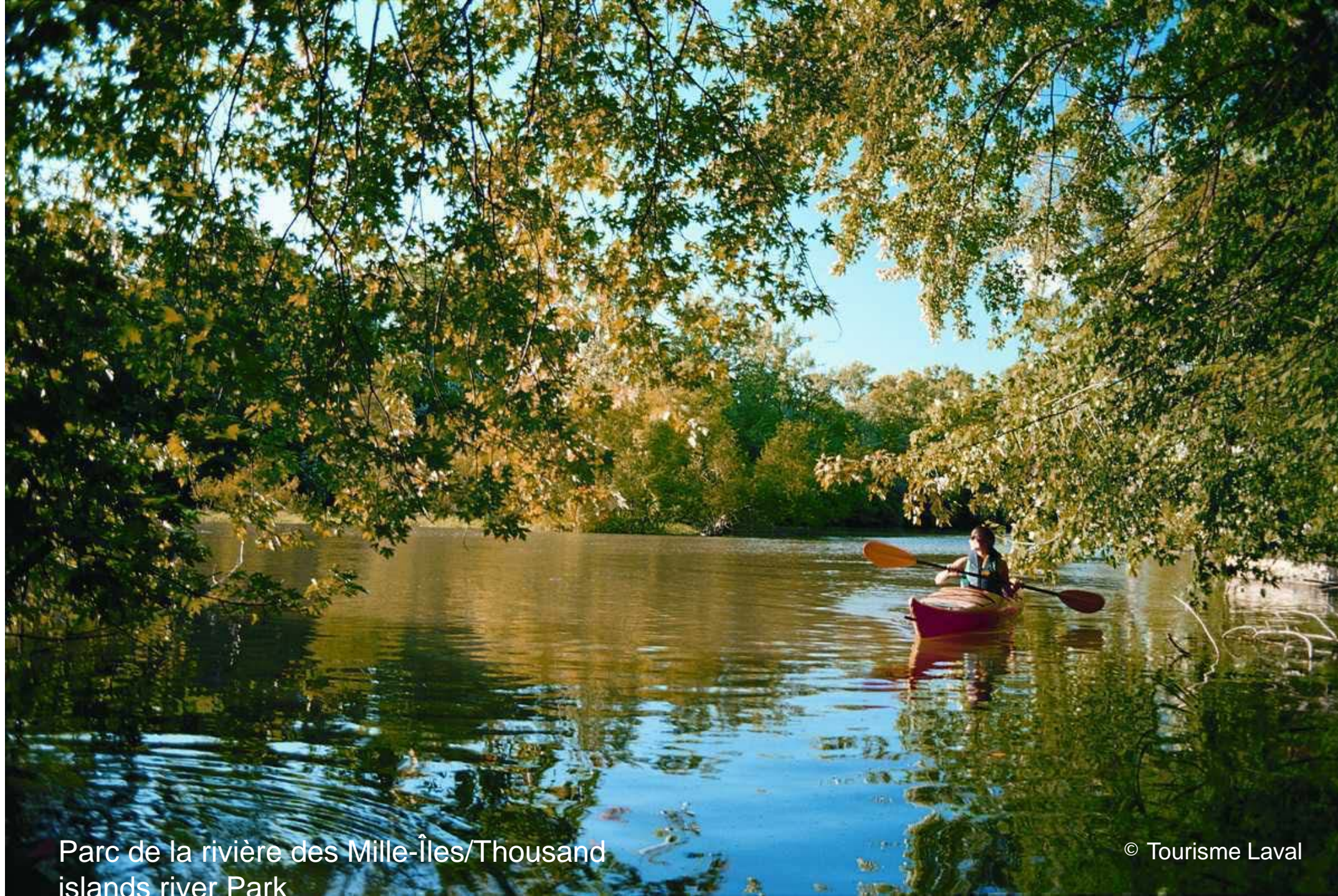
Parc de la rivière des Mille-Îles/Thousand islands river Park