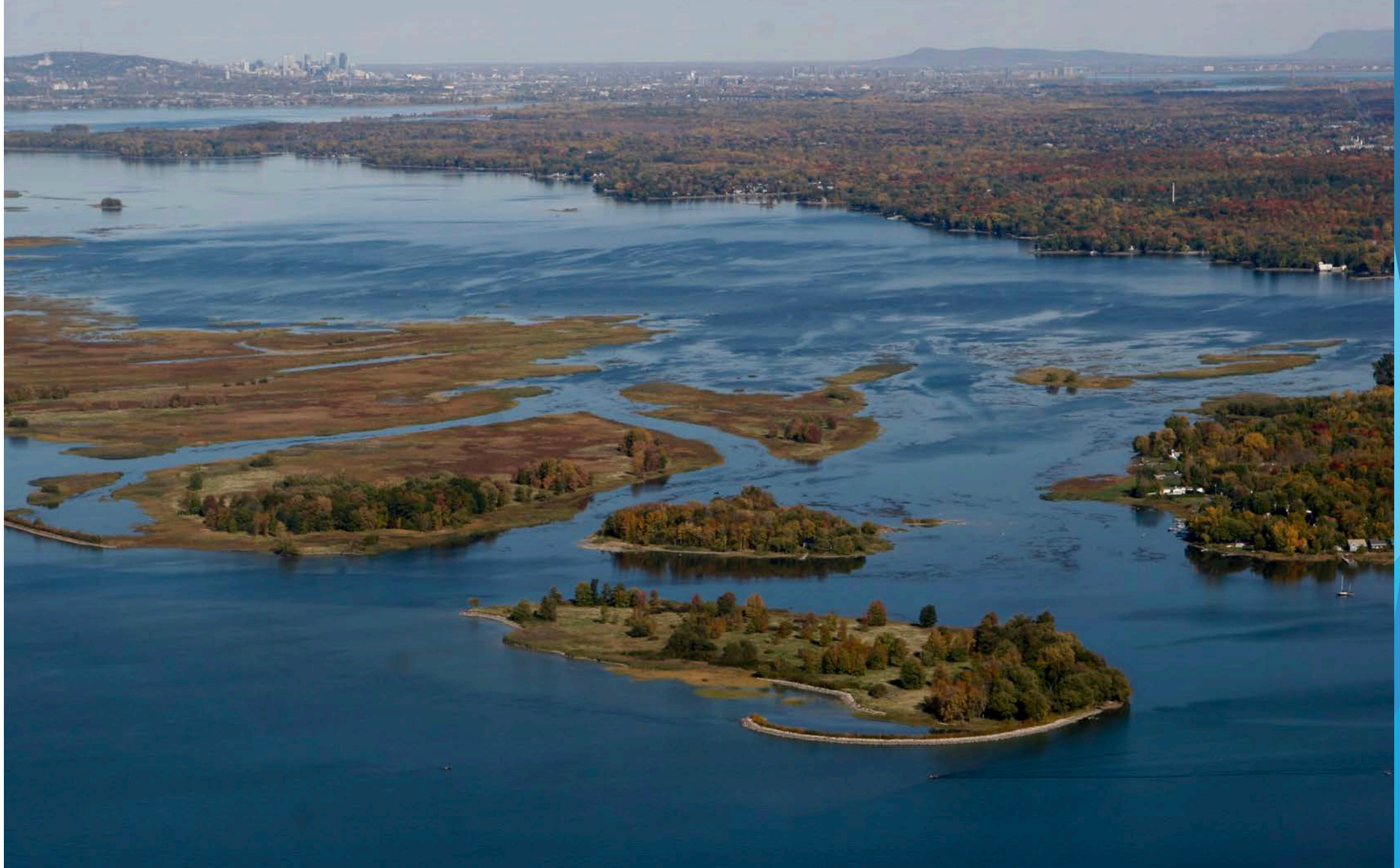
Îles de la Paix, Lac Saint-Louis/Peace islands, St-Louis Lake