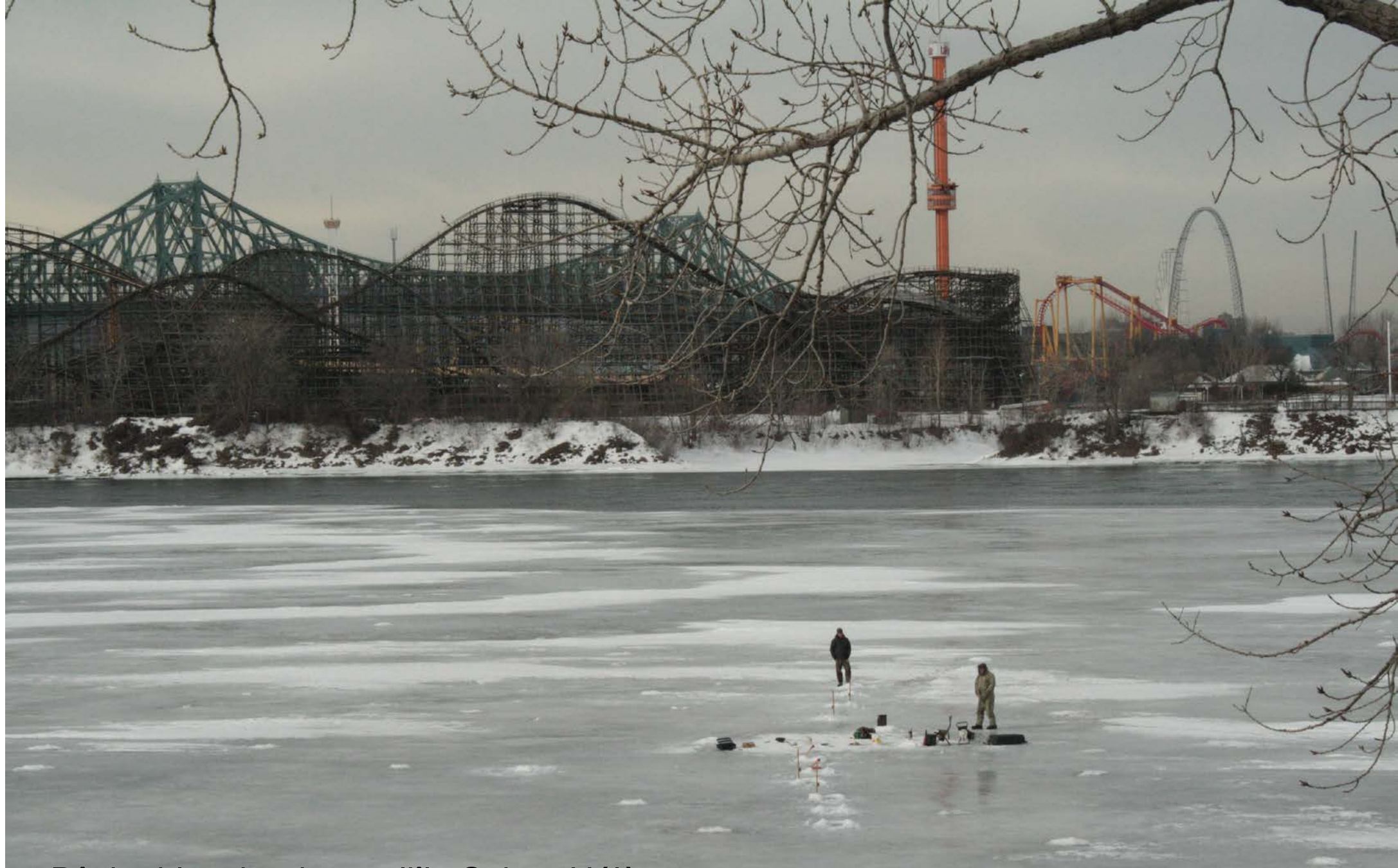
Pêche blanche devant l'île Sainte-Hélène island