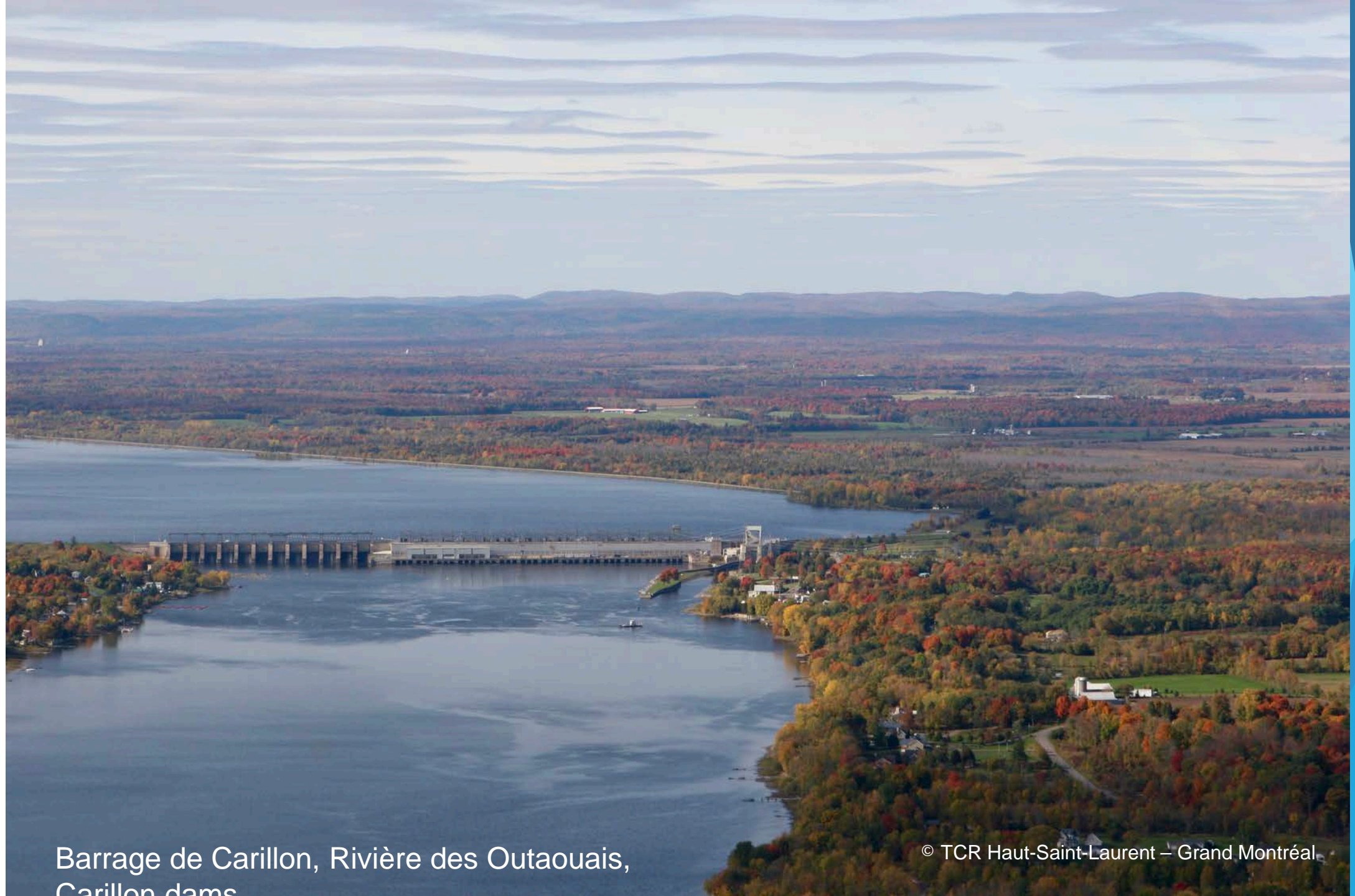
Barrage de Carillon, Rivière des Outaouais, Carillon dams