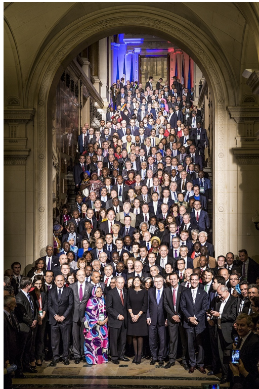
446 Mayors Convened for the Climate Summit for Local Leaders, Paris

Greenhouse Gas Reduction Efforts Among Members of the Cities Initiative