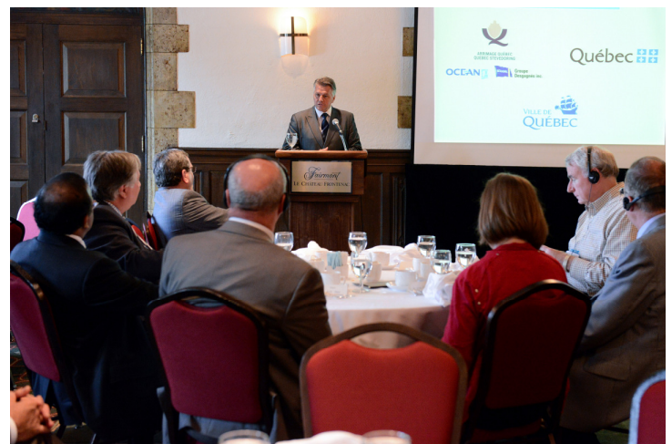
Laurent Lessard, Minister of Municipal Affairs of Québec, during his keynote address at the 2012 Annual General Meeting.

Laurent Lessard, Minister of Municipal Affairs of Québec, delivered a keynote address over lunch. He discussed the role of municipalities in water management and congratulated attendees for their willingness to share best practices towards the greater good of the Great Lakes and St. Lawrence. Mayor Labeaume closed the Conference by stressing the need for action and the prime position of municipal administrations in water management. Representatives from Marquette, Michigan showcased a video inspiring attendees to come and visit this wonderful lakeside town of the Upper Peninsula of Michigan for the 2013 Annual Meeting and Conference on June 19-21, 2013.