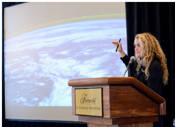
Ms. Julie Payette during her keynote address at the 2012 Annual General Meeting.

Mayor Labeaume welcomed municipal leaders, government and policy officials and other concerned stakeholders to Québec City. He introduced the dynamic speaker, Canadian astronaut and Québec Scientific Delegate Ms. Julie Payette. She shared her unique view of the relationship between water and cities from her experience in space and stressed the importance of caring for our shared waters with spectacular photos of many cities in the Great Lakes and St. Lawrence basin taken from space.