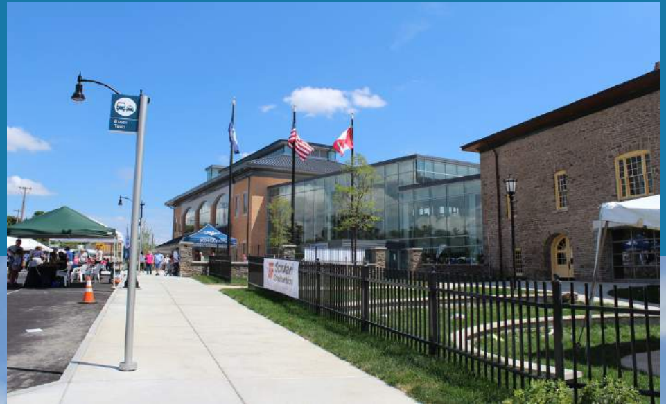
NF International Amtrak Station