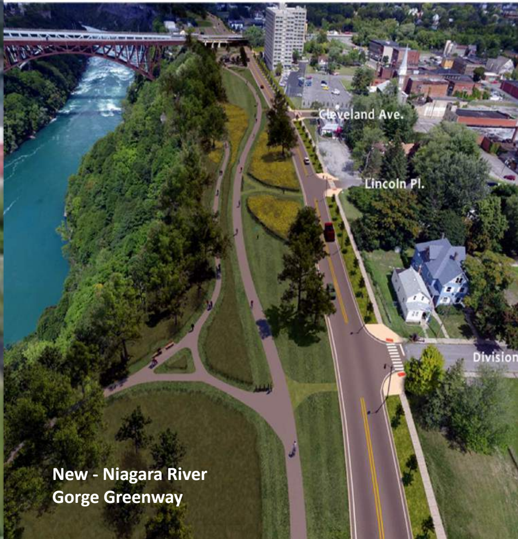
New - Niagara River Gorge Greenway