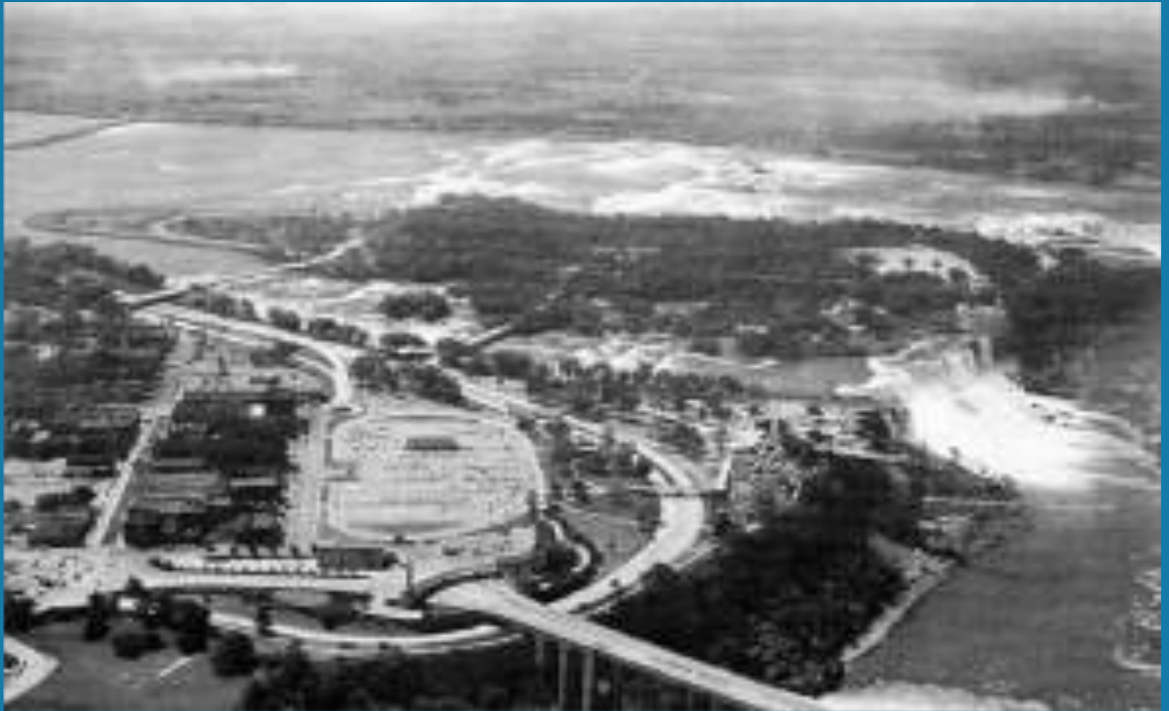
Robert Moses Parkway – Downtown NY c1962