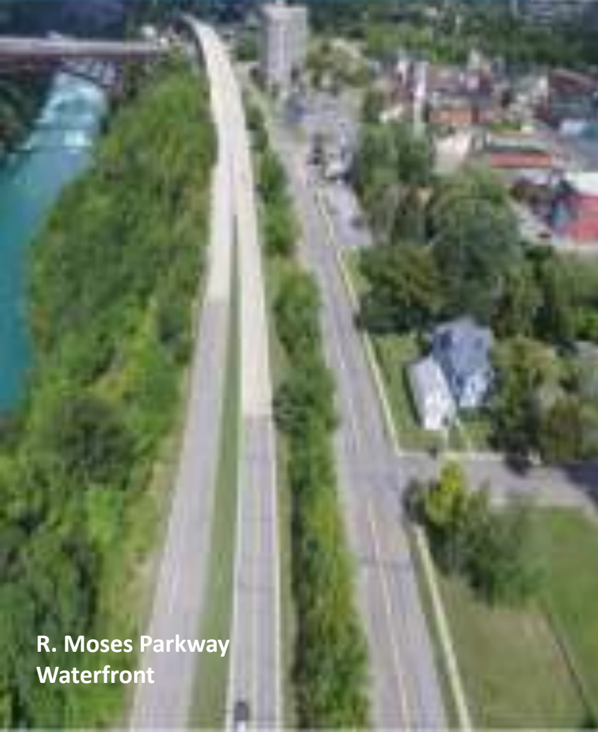
R. Moses Parkway Waterfront