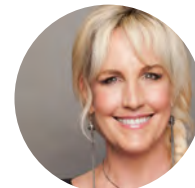
Erin Brockovich Keynote Speaker