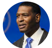
Michael Regan Administrator of the U.S. Environmental Protection Agency