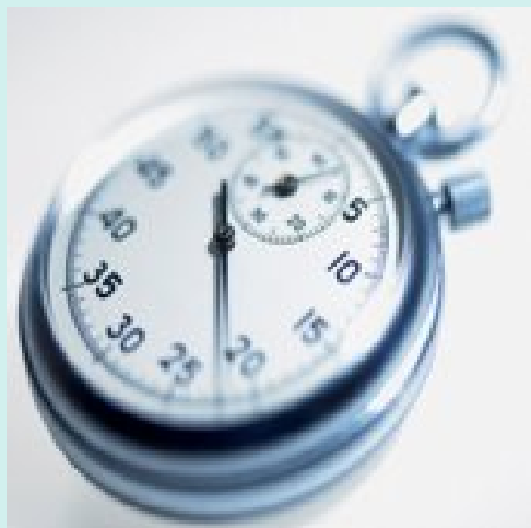
Short Funding Windows