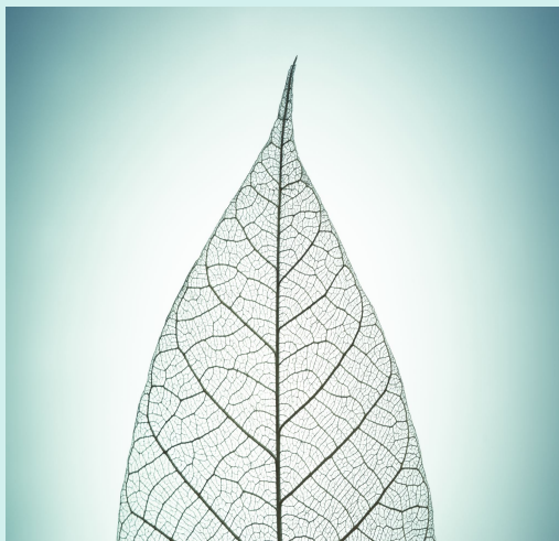
Environmental and Sustainability Goals