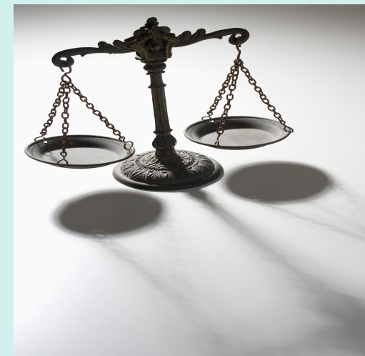
Social Equity, Accessibility, & Inclusion