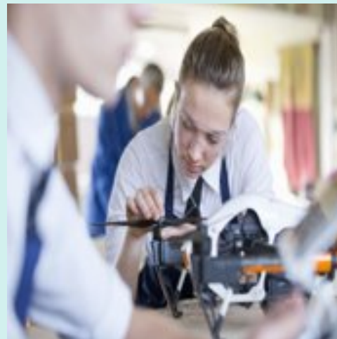
Private Sector Engagement